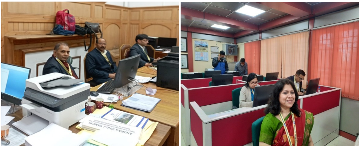
Glimpses of the Lok Sabha Camp Office and Cyber Café

A Camp Office of the Lok Sabha Secretariat was set up in the ground floor of the Assembly to monitor and manage the arrangements of the Conference. 10 computers with printers were installed in the Camp Office and high speed connectivity over NICNET was extended. A Cyber Café was also set up using more than 15 computer sets with high speed internet and printers for the use by participants, officials.